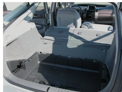
Hidden storage is available below the false floor.