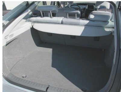
Fold both right seats for 8 feet of storage length.

Just Drive It. Ignore all the technology. Let the computer worry about how to save gas and achieve the AT-PZEV emission rating for you. Enjoy the remarkably smooth & quiet ride.