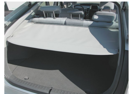
Roll out the hatch cover to conceal cargo.