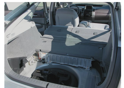
Spare-Tire & Battery-Pack revealed.